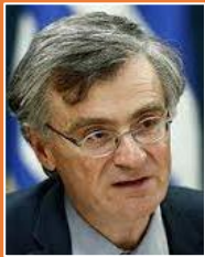
Sotirios Tsiodras (Greece)