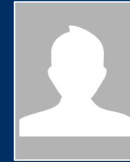
International Longevity Centre (TBD)