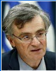
Sotirios Tsiodras (Greece)